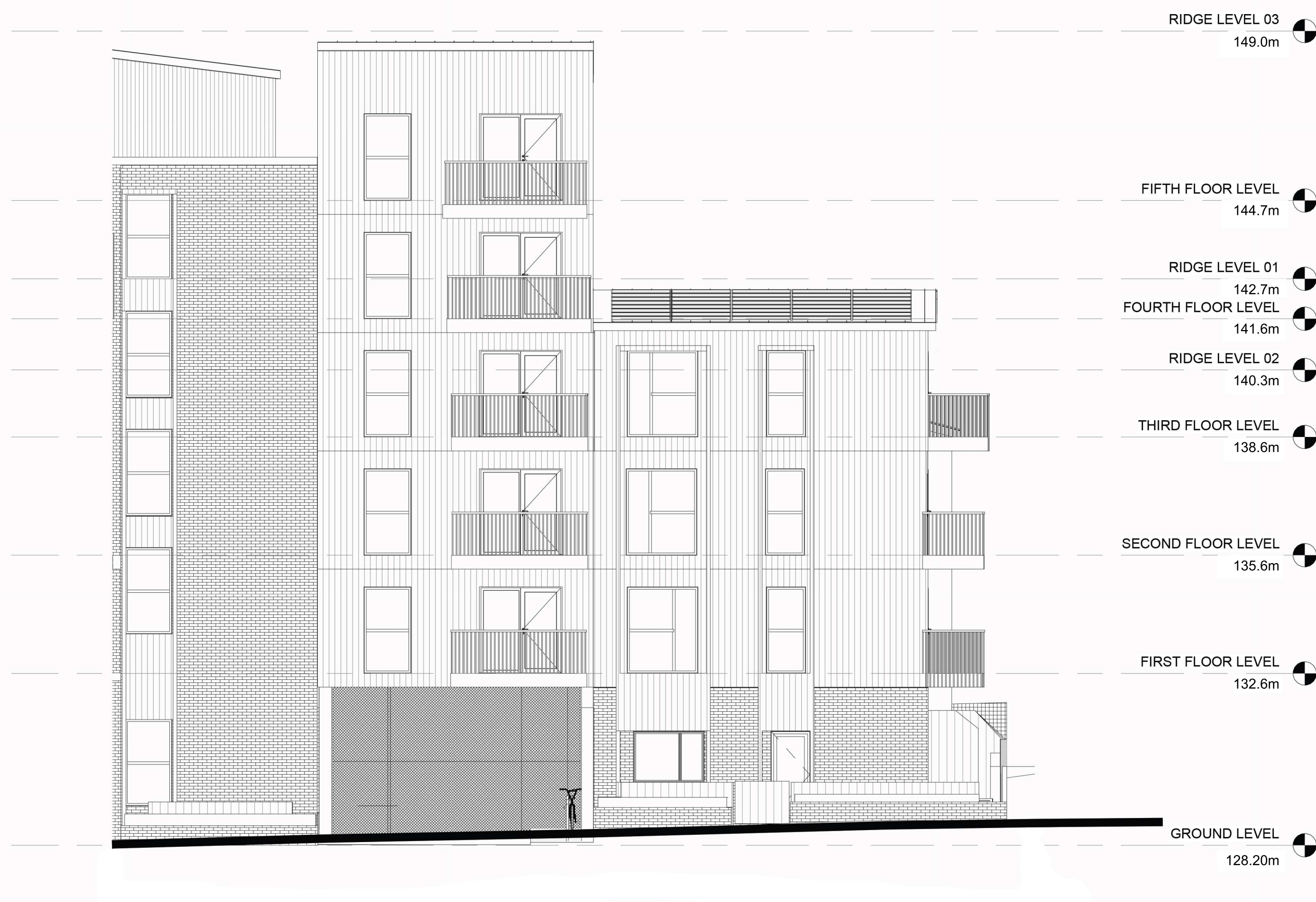
3 ELEVATION B1 1 : 100