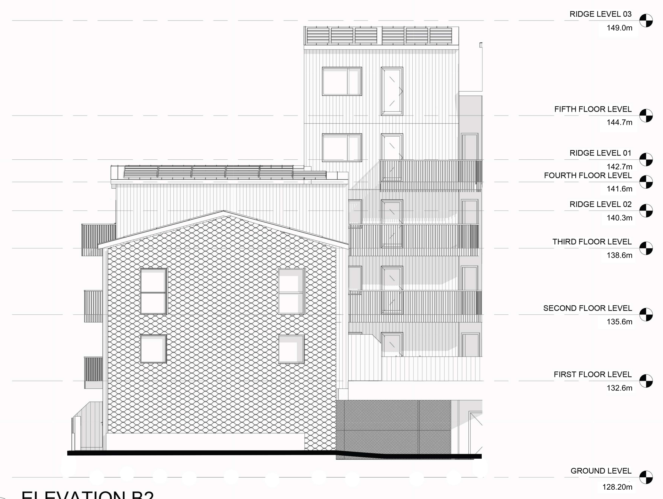
2 ELEVATION B2 1 : 100