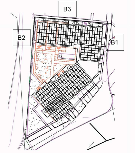
1 KEY PLAN 2 1 : 1000